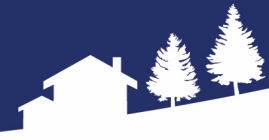
Table 3-3: Transportation Opportunities and Recommendations