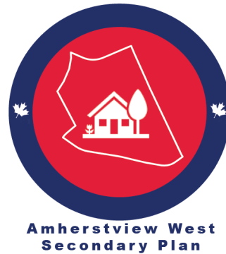
Figure 2: Project Logo Option